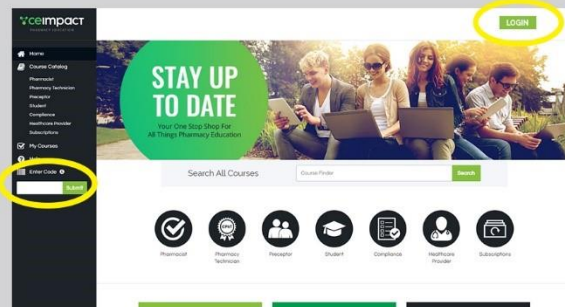
Login to CEI account and Enter Access Code