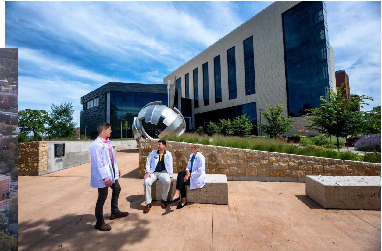
University of Iowa College of Pharmacy