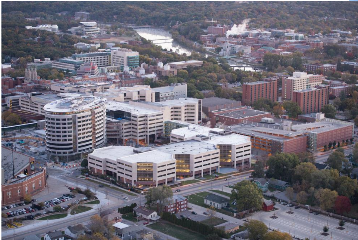
University of Iowa Hospitals & Clinics